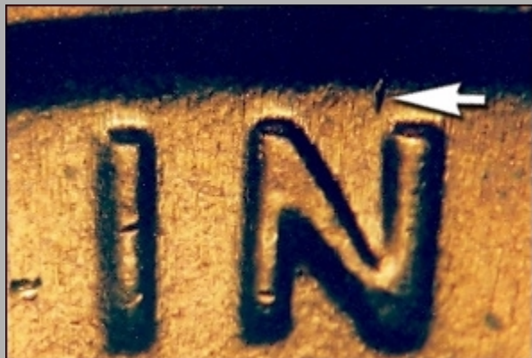
Short die gouge above "N" of the word IN.