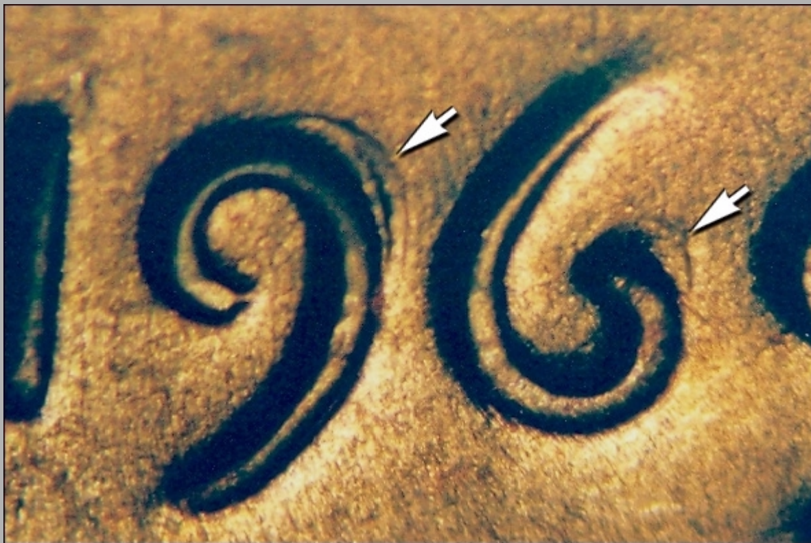
Exhibits raised remnants of the digits "96" of the date to the northeast for the 1969 1c CDDO-002.