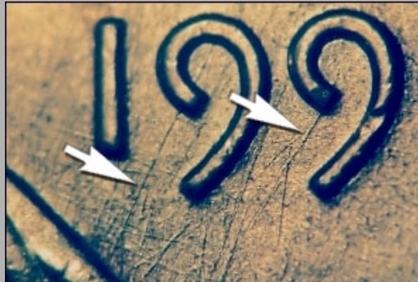
Die scratches extend through the date.