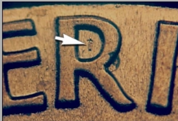
Die gouge within the letter "R" of AMERICA.