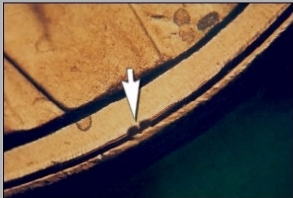
Die gouge near the bust at the inner rim.